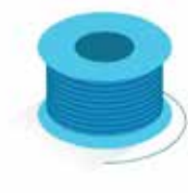
ZYEX™ fibres from 0.07 mm to 2.00 mm