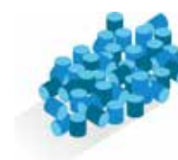
VICTREX™ PEEK polymer pellet forms for other geometries